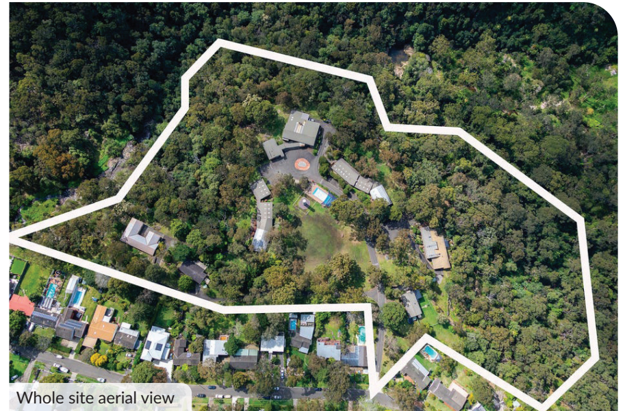
Whole site aerial view